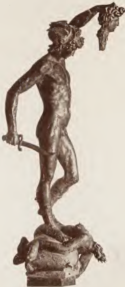
Perseus with Head of the slain Medusa By Benvenuto Cellini From the bronze statue in the Musee Nationale, Florence